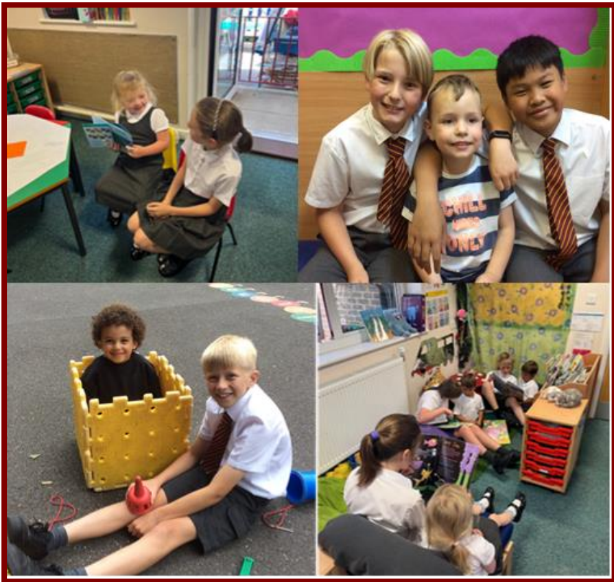
Reception pupils with their buddies

In Reception your child will be assigned a 'buddy' - usually an older child for the youngest children - who will support them as they learn about their new school. For children from after Year 1, a buddy will be assigned from their class group. In this way we offer a friendly face from the first day to help your children settle in.