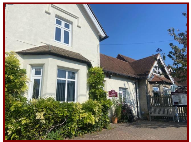
Prospectus For entry in 2024/2025

Be the Best You Can Be; Living 'life in all its fullness' (John 10:10)